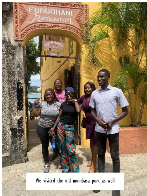
We visited the old Mombasa port as well