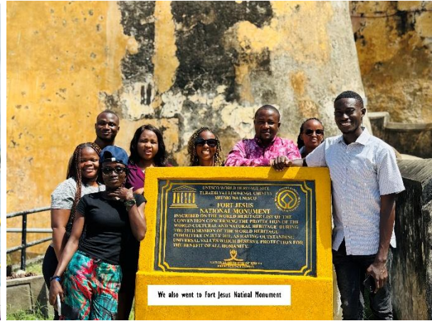
We also went to Fort Jesus National Monument