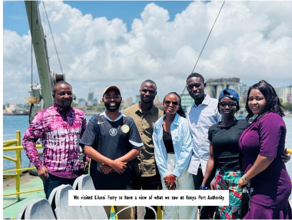
We visited Likoni Ferry to have a view of what we saw at Kenya Port Authority